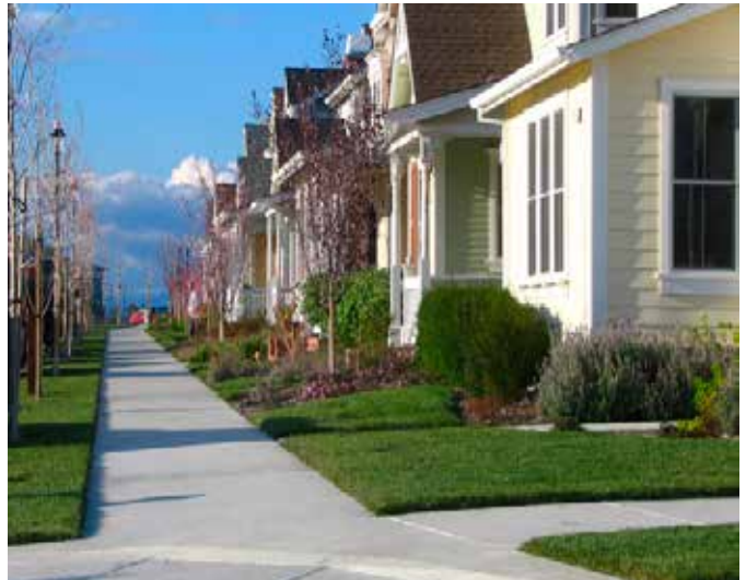
Well-built sidewalks can last 25 years or more with little more than minimal care.

The success of any tool lies in getting it right, and that's true of sidewalk design and construction. Try the following: