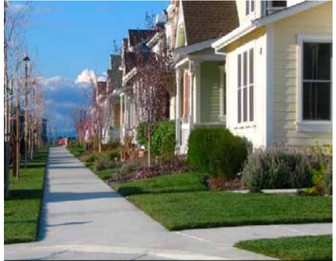
Well-built sidewalks can last 25 years or more with little more than minimal care.

The success of any tool lies in getting it right, and that's true of sidewalk design and construction. Try the following: