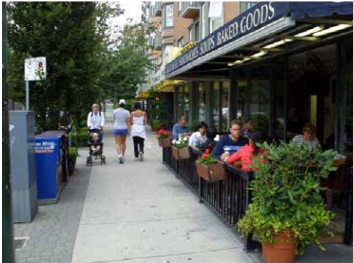
Good sidewalk widths: five to seven feet in residential areas, eight to 12 feet in downtown settings.