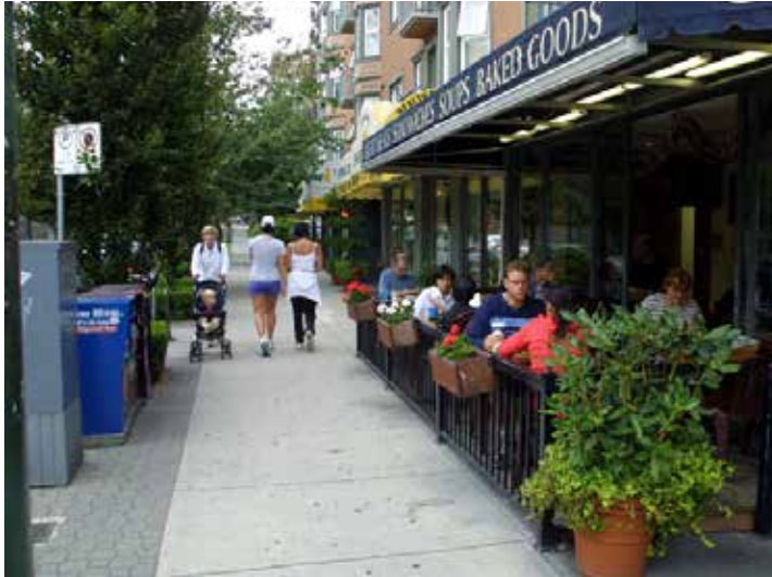
Good sidewalk widths: five to seven feet in residential areas, eight to 12 feet in downtown settings.